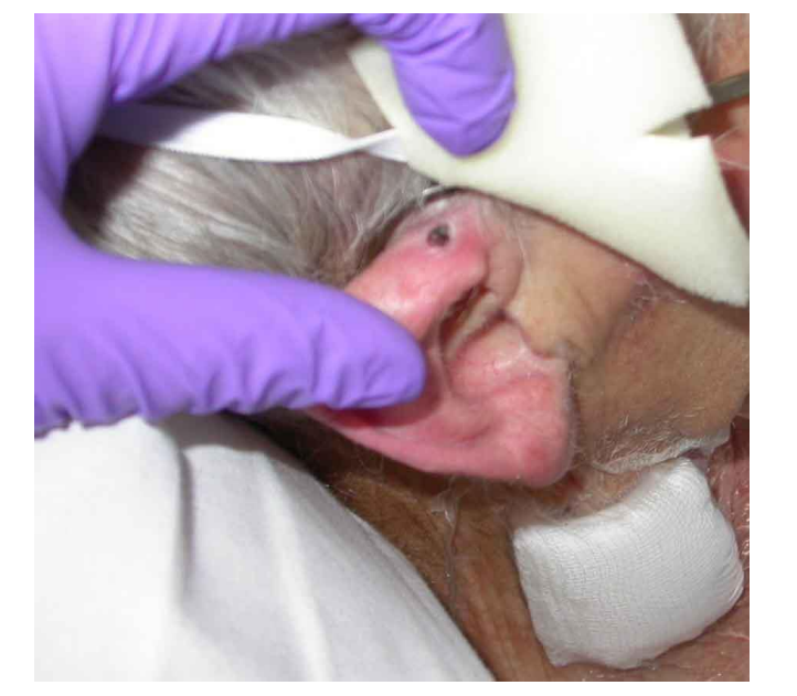
Damage has occurred where the spectacles and elastic from the oxygen mask press on the pinna of the ear