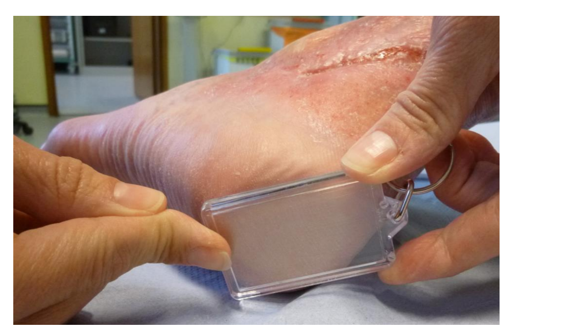
Example of skin blanch

Healthy skin may develop transient redness when subjected to pressure – for example, if the legs are crossed. To test if damage has occurred, light finger pressure should be applied to see if the skin blanches (goes white). In darker skin tones, redness may present as a darker area that is grey or purplish. This is not a pressure ulcer.