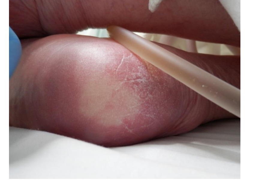
Blanch in darker skin