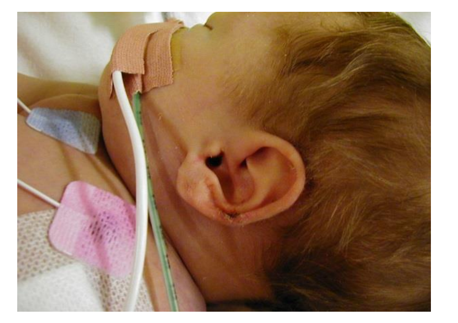
This infant has Category 1 damage to the cheeks and a small unstageable ulcer on the ear

While some DRPU may also be allocated a category of damage, others may not as they are on parts of the anatomy that do not have the same structures as the skin – for example, the mucosal membrane. Where possible, a device-related ulcer should be categorised and the presence of a device noted by the addition of a (d) after the category.