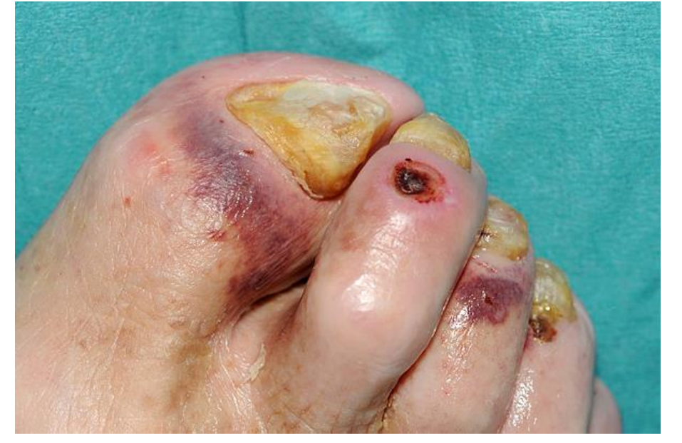
Although difficult to identify, this PU was caused by the patient having their feet caught in the bed sheets which were tightly twisted across the toes