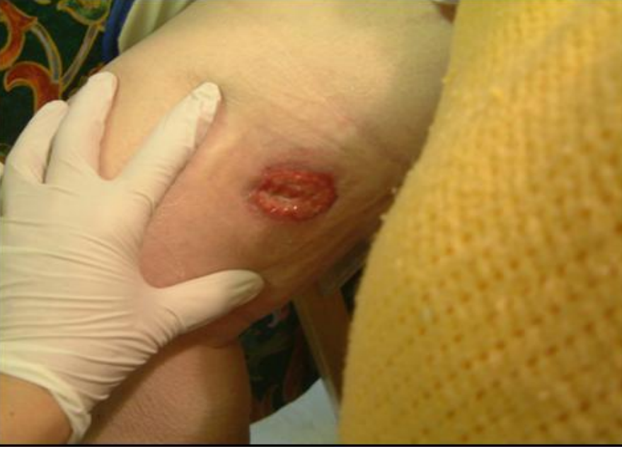
Although difficult to identify, this PU was caused by the leather ring at the top of an old-fashioned calliper