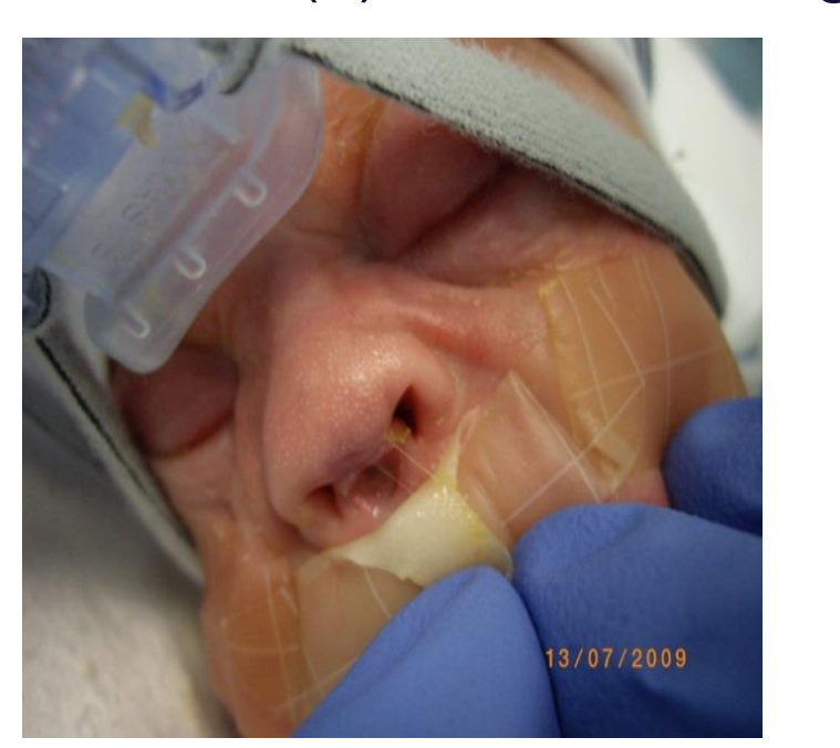
This neonate has damage to the nares that cannot be categorised