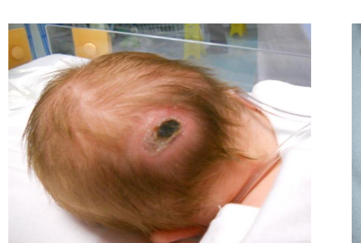
This occipital ulcer is covered by softening necrosis

Until enough slough and/or eschar is removed to expose the base of the wound, the true depth, and therefore category, cannot be determined. Stable (dry, adherent, intact without erythema or fluctuance) eschar on the heels serves as 'the body's natural (biological) cover' and should not be removed.